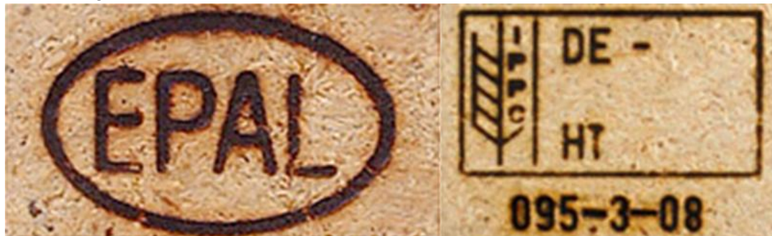
left + right corner block